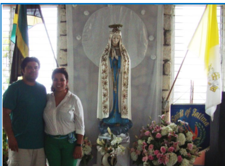
Enjoy the experience of a local church while on vacation.